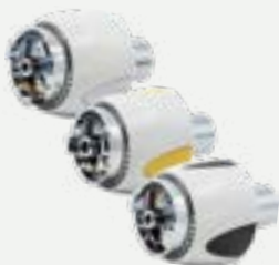
Probe type AFNOR NF-S 90-116 with thread ISO G. 1/4" F.