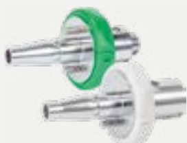
Probe type JIS T 7101 with thread ISO G. 1/8" M.