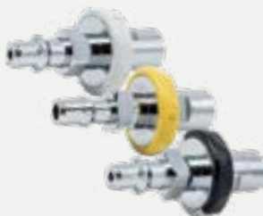
Probe type DIN 13260 with thread ISO G. 1/4" F.