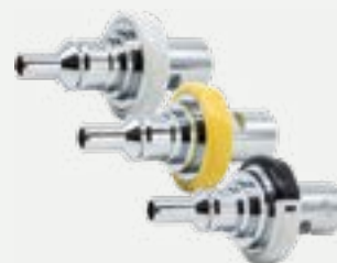
Probe type UNI 9507 with thread ISO G. 1/4" F.