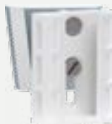
Anodized aluminum wedge for OHMEDA rail clamp bracket, with slide 25x5 mm, 30x5 mm or 45x5 mm.