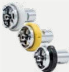
Probe type AFNOR NF-S 90-116 EASYFIX® with thread ISO G. 1/4" F.