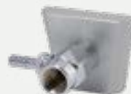
Anodized aluminum wedge for OHMEDA rail clamp bracket, with nipple threaded ISO G. 1/4" F. and hose connector Ø 6 mm (for medical gases) or Ø 7.5 mm (for vacuum).