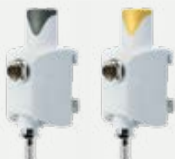
ABS clamp for rail 30x10 mm and 50x10 mm complete with nipple threaded ISO G. 1/4" F. and hose connector Ø 6 mm (for medical gases) or Ø 7.5 mm (for Vacuum).