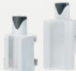
ABS clamp bracket for rail 30x10 mm and 50x10 mm, with slide 25x5 mm, 30x5 mm or 45x5 mm.