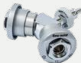
Outlet duplicator type UNI 9507.