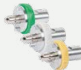
Probe type OHMEDA with thread ISO G. 1/4" F.