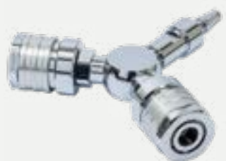
Outlet duplicator type BS 5682.