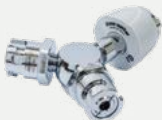
Outlet duplicator type AFNOR NF-S 90-116.