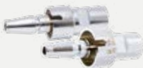
Probe type BS 5682 with thread ISO G. 1/4" F.