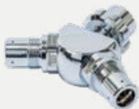
Outlet duplicator type NIST EN ISO 5359.