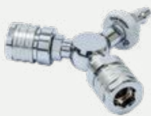
Outlet duplicator type DIN 13260.